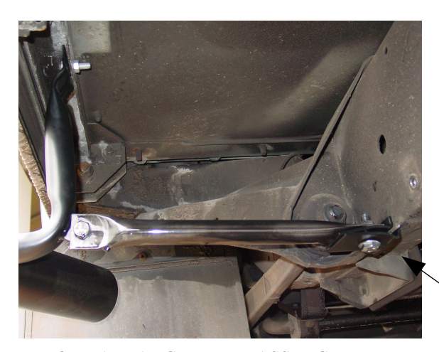
FRONT ARRANGEMENT PASSENGER SIDE LOOKING FORWARD

The steps are constructed of mild steel and powder coated to protect against rust, to ensure further protection paint tubes with smooth hammerite or similar. These steps are designed for ALL models of Defender 90 with coil springs.