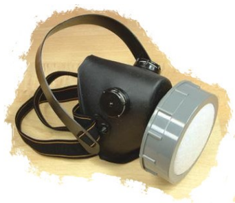
Standard face mask