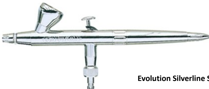
Evolution Silverline Solo

The Silverline features an all Chrome finish and a manual paint flow restrictor on the rear handle.