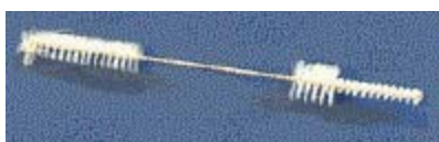
H & S Cleaning Brush

Cleaning pot Acts as a desktop stand when airbrushing and collects unwanted spray when cleaning the brush.