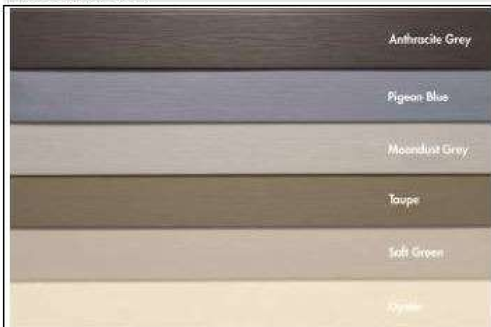
Figure 1 Available colours