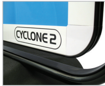
Frames available printed or suitable for vinyl application.