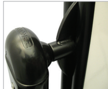
Hard wearing pivots allow panel to move in the wind.