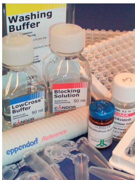
▲ Fig. 1: Ready-to-use goods for ELISA are available in great variety - even from certified manufacturers.

These problems are often described and generally known and appear in almost every assay. The success of strategies to improve the selectivity and to avoid matrix effects has to be examined within the validation. Generally known