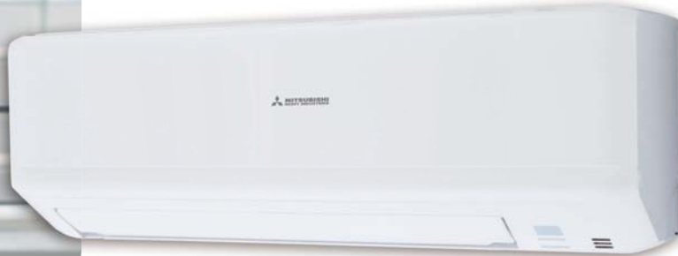
SRK25ZSP-W, SRK35ZSP-W, SRK45ZSP-W